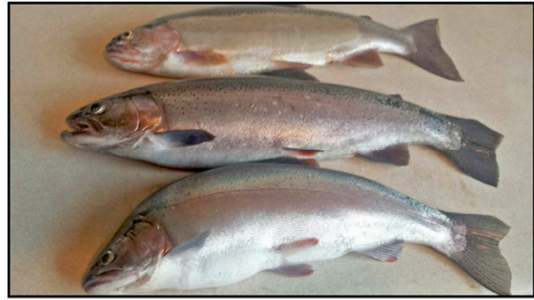
Steve's three fish – the bottom one with the 94.4 condition factor. Tuck in Chubbs!!